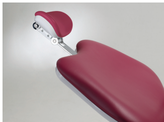
050 Twin-articulating headrest

Ultra-slim backrest improves Operator's working comfort