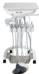
CLESTA II-MC 4 Air or Electric 5 versions