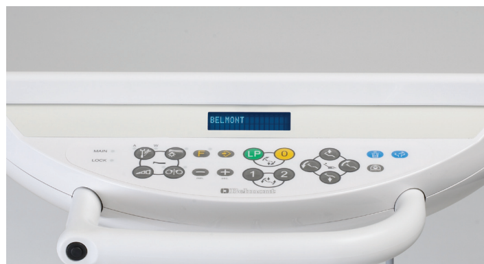
'E' version control panel includes instrument, chair, spittoon and light controls