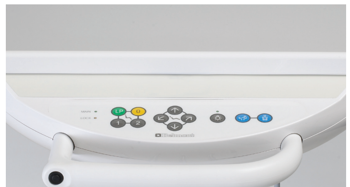
'A' version control panel includes chair and spittoon controls

Control all chair movements by hand or foot: by hand from both the Operator's and Assistant's console; by foot using the foot control. Spittoon functions and ON/OFF light control 1 are also activated from both the Operator's and Assistant's console.