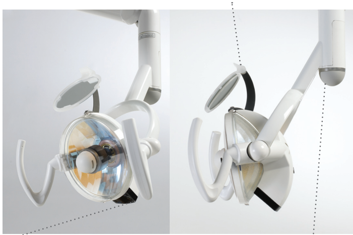
Retractable Patient mirror

ON/OFF Touchless sensor and soft-push button (with light intensity indicator) for Composite Curing Safe Mode and two light intensity settings: Low – 18,000 Lux and High – 28,000 Lux. 4200 Kelvin