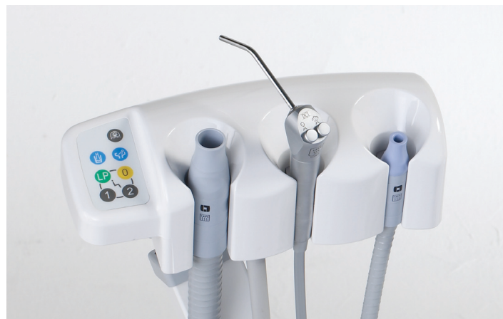
Assistant's console with chair, cuspidor and light 2 controls