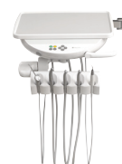
CLESTA II-M 4 Air or Electric 5 versions