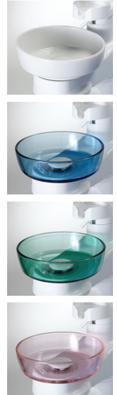
Spittoon bowl options: blue/green/pink glass (porcelain as standard)