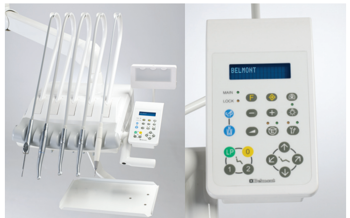
Continental Rod type Operator's console ('E' version)