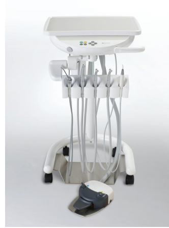
CLESTA II-MC and CLESTA II-M 'A' and 'E' versions

ON/OFF Touchless sensor and soft-push button (with light intensity indicator) for Composite Curing Safe Mode and two light intensity settings: Low – 18,000 Lux and High – 28,000 Lux. 4200 Kelvin