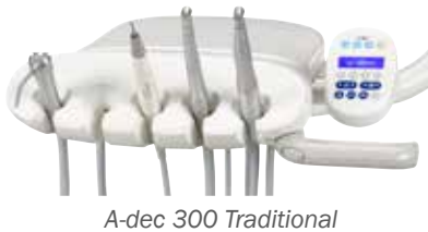
A-dec 300 Traditional