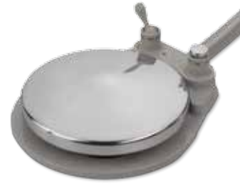
Disc foot control with chip blower

Disc style with chip blower— or new A-dec lever style for precise modulation of electric and pneumatic handpieces.