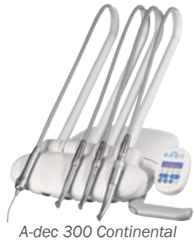
A-dec 300 Continental