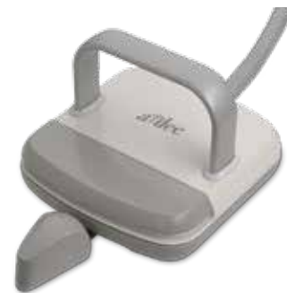
Lever foot control