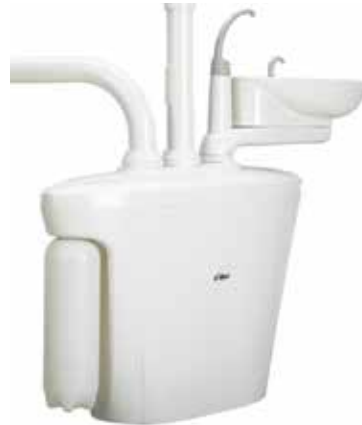
Cuspidor and support center

The porcelain cuspidor swivels for just the right patient position. Easy-to-fill, two-liter water bottle provides a continuous water supply through multiple procedures. The support center offers ample storage room to add ancillaries such as amalgam separators and vacuum systems.