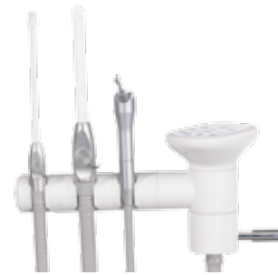
A-dec (aluminum) with touchpad

Three-position holder and telescoping arm conveniently positions vacuum instruments for patient access.