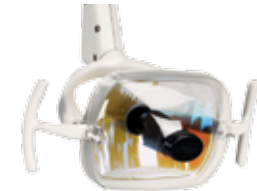
A-dec 500 Halogen