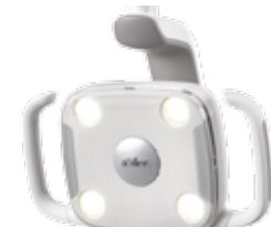
A-dec 300 LED