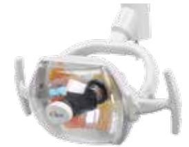
A-dec 200 Halogen

A-dec dental lights provide true light for accurate diagnosis, reduced eyestrain and unparalleled ergonomics.