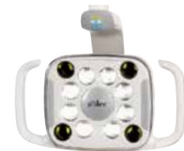
A-dec 500 LED