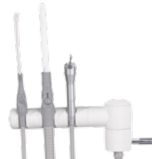
Durr (polymer) without touchpad